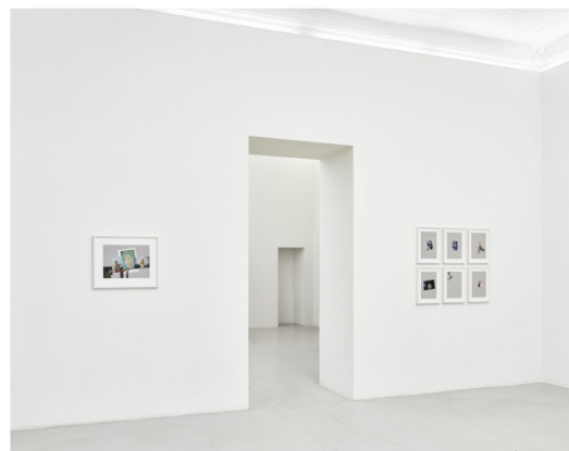
Installation view at "Satisfy Me", the Wemhöner Collection at Kunstsaale Berlin.

"Satisfy Me" is on display at the Kunstsaale Berlin until 31st March 2018.