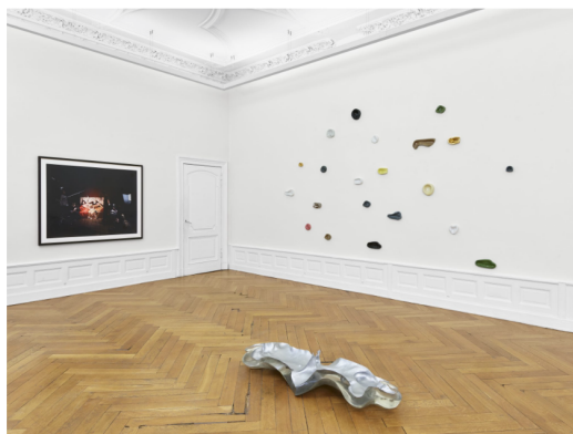
Installation view at "Satisfy Me", the Wemhöner Collection at Kunstsaale Berlin.