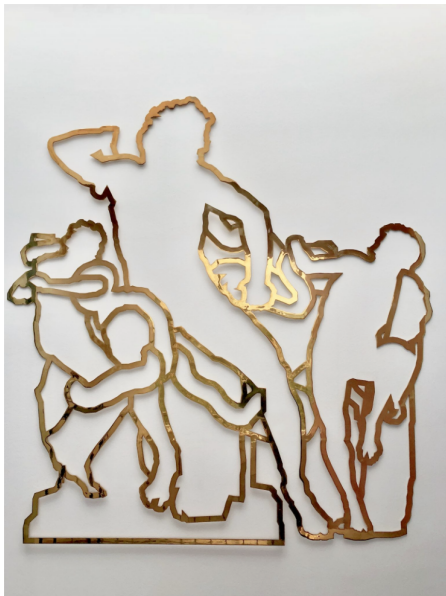
XU QU, Lineament (Laocoon), 2015.